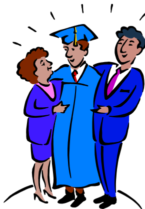
Letting go: Difficult, yes, but worth it!

ents should provide a quiet place and a structured time for study, but only give help when it's truly needed. You should "spot check" the agenda and ask to see completed homework on occasion, but clearly communicate to your student it is your expectation that homework is their responsibility.