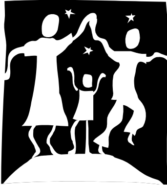
Let’s face it. Parenting middle-schoolers can be tricky.

Children need to feel they are okay. Point out that other children are experiencing the same thing. Tell them your own stories about growing up.